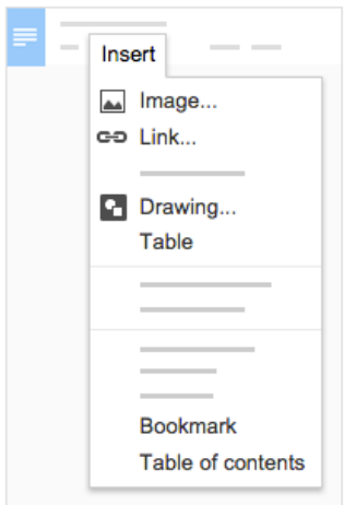
Image Insert an image from your computer, the web, or Google Drive.

Enhance your document by adding features.